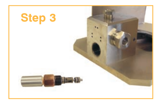
Replace cartridge and install in block