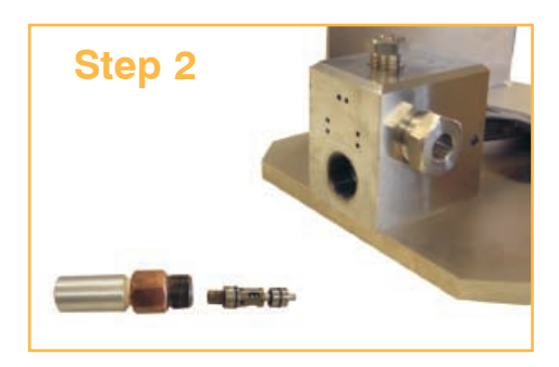
Align lobe on cartridge assembly with groove in cartridge holder and Turn counter clockwise to unlock and remove.