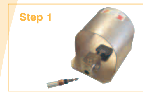
Remove dump adapter